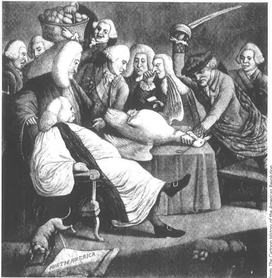
In “The Wise Men of Gotham and their Goose,” a British cartoonist pokes fun at efforts by Parliament to squeeze more revenue out of the American colonies.

The Sugar Act and the Stamp Act raised revenue which was earmarked specifically to offset the cost of stationing British troops in North America. The announcement of the new