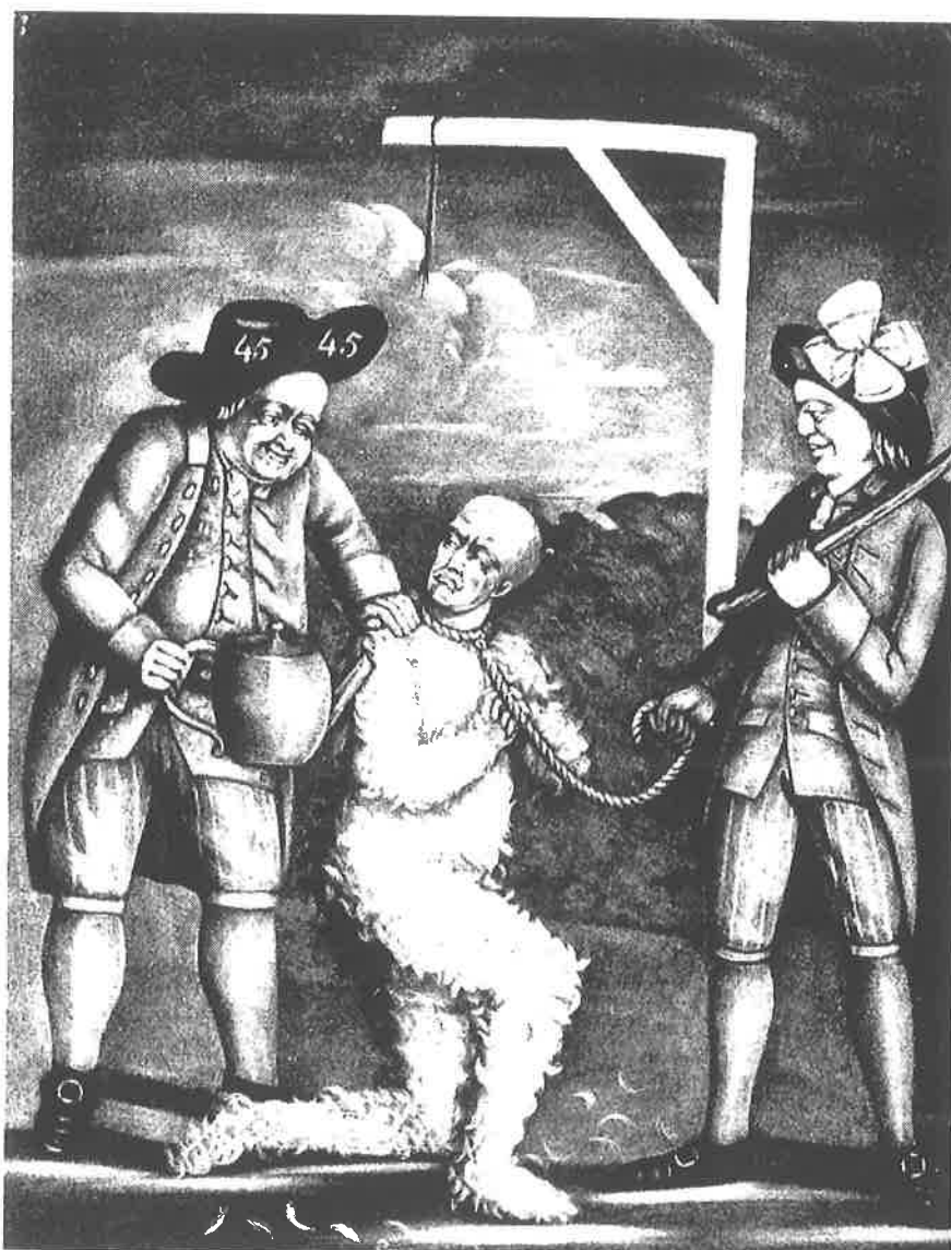
Colonists tar and feather a customs house official for accepting a shipment of tea.