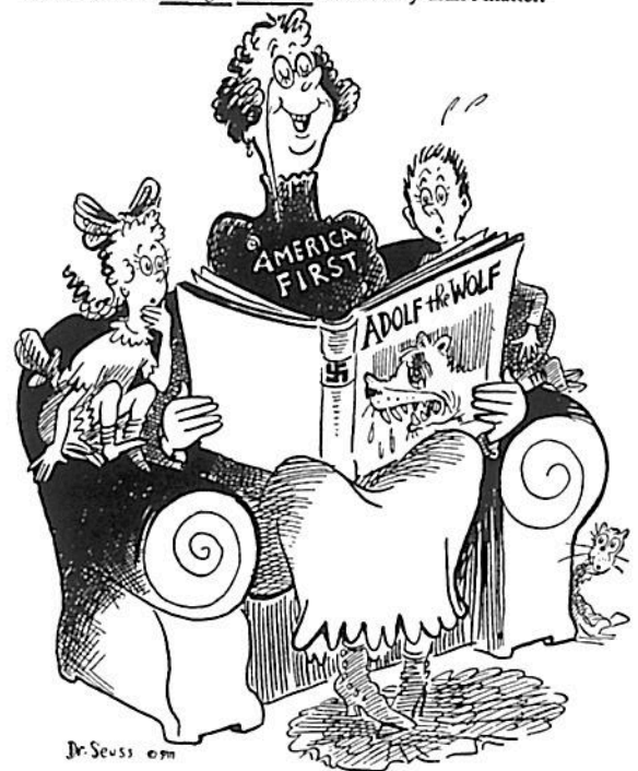
Re-printed in cooperation with the Dr. Seuss Collection at the University of California at San Diego.

... and the Wolf chewed up the children and spit out their bones . . . But those were Foreign Children and it really didn't matter."