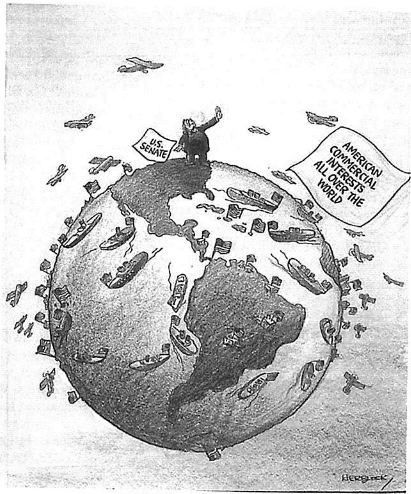
“No Foreign Entanglements!”

On October 3, 1935, Italy, led by its fascist dictator Benito Mussolini, attacked the African country of Ethiopia. Because Ethiopia was an independent country, not a European colony, and it happened to border the Italian colonies of Eritrea and Somaliland, Mussolini saw it as